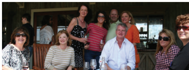
Wine Tour participants enjoy networking on the porch