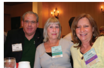
Getting set for the Banquet