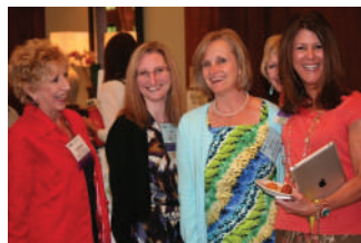
Opening reception at Omni Charlottesville