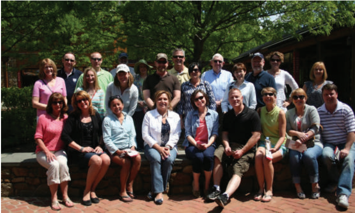
Members take a tour of Thomas Jefferson's Monticello