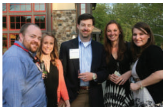
Members at the Gala Reception

Mark your calendars now and make it a point to join VSAE at the 2015 Annual Conference, May 3-5.