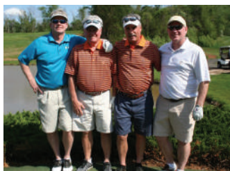
Members golfing at Birdwood