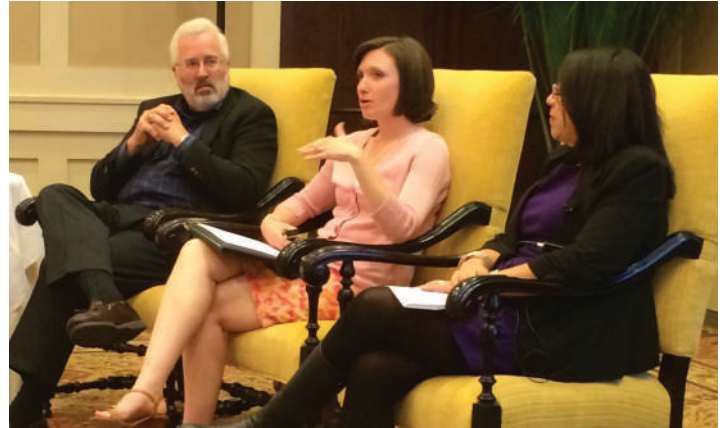
Chief staff executives talk about the path forward for emerging association professionals